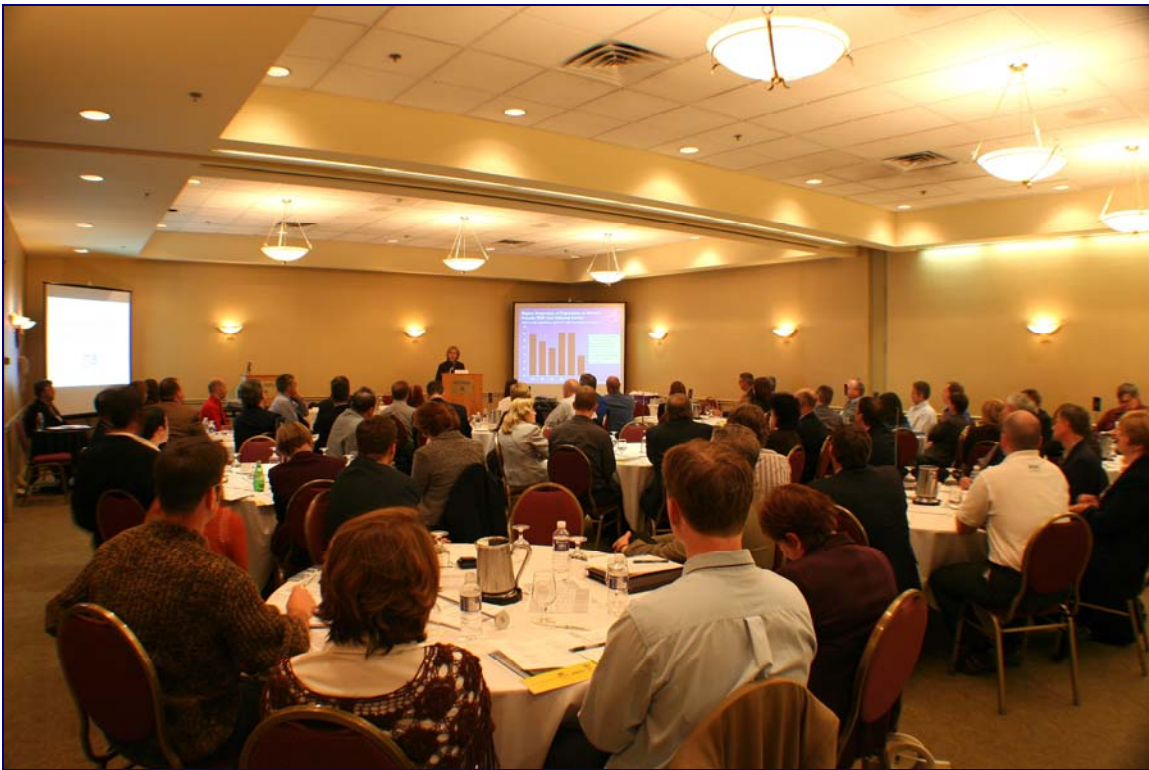
ICT Symposium participants

Symposium in Halifax on October 19 and 20. This symposium, attended by over 70 participants from business, industry, sector organizations, college faculty, administrators and students, as well as government representatives, focused on the role colleges and industry must play to ensure that Atlantic employers have a ready supply of ICT trained persons to meet their growing demand. A symposium report containing recommendations for follow-up will be published in November 2006.