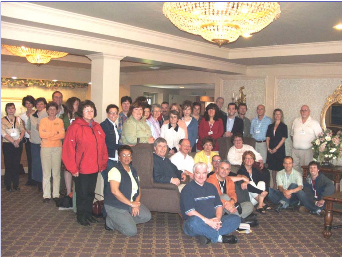
Special Needs Workshop Participants

Thanks to the great work of the NBCC organizing committee, with the support of the APCCC's Strategic Organizational Learning Task Group, participants enjoyed a great learning and networking opportunity.