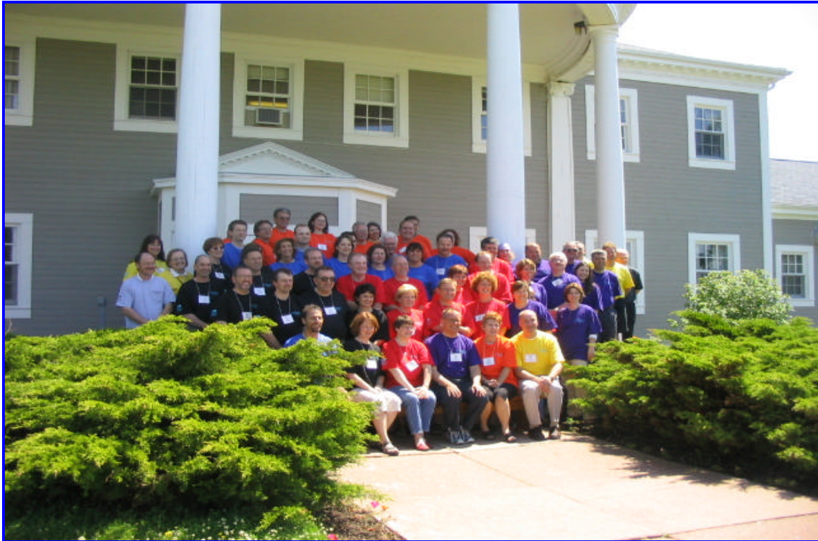
“Learning Centered” Learners: ACDI, June 2004

Now the task group is preparing for another institute in the spring of 2005. This institute will be designed for student services and support staff who are a key part of the team in advancing the concept of the “Learning Centered College”. In addition, the task group has been asked to present at the Association of Canadian Community College Annual Conference to be held in Moncton, New Brunswick in the spring of 2005.