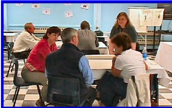
A serious ACTEC learning moment.

Keeping true to its mandate, ACTEC has been busy organizing and sponsoring annual conferences among other activities of professional exchange. The most recent conference was held from May 25-27, 2004 and co-hosted by the Washington County Community College in Calais, Maine, USA and the New Brunswick Community College, St. Andrews. The conference was aimed at post-secondary hospitality and tourism educators, as well as deans, program chairs, suppliers and secondary school tourism educators.