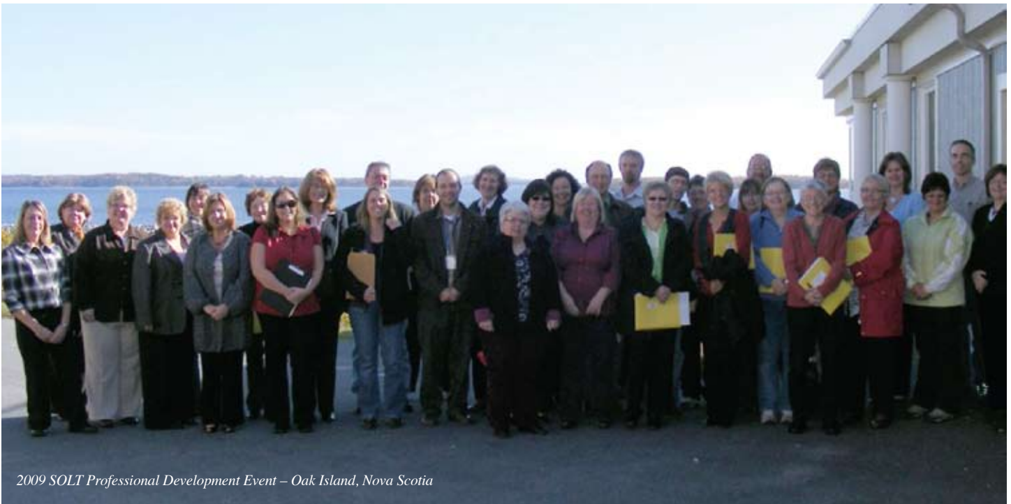
2009 SOLT Professional Development Event – Oak Island, Nova Scotia

During the reporting period, the Atlantic Provinces Community College Consortium (APCCC), a partnership between community colleges and Atlantic government departments responsible for community colleges, provided leadership and resources in advancing collaborative and cooperative initiatives which are