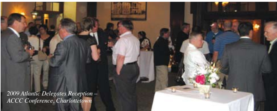
2009 Atlantic Delegates Reception – ACCC Conference, Charlottetown